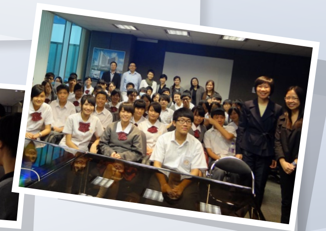
Career Navigation Event - Students visiting an architecture company 就業導航計劃—參觀建築師公司，了解營運過程