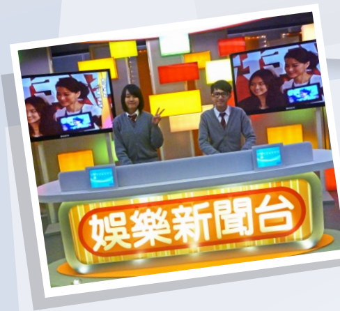
Students visiting the Cable TV studio and getting a taste of a TV anchor's daily work 帶領學生參觀有線電視錄影廠，體驗電視主播的日常工作