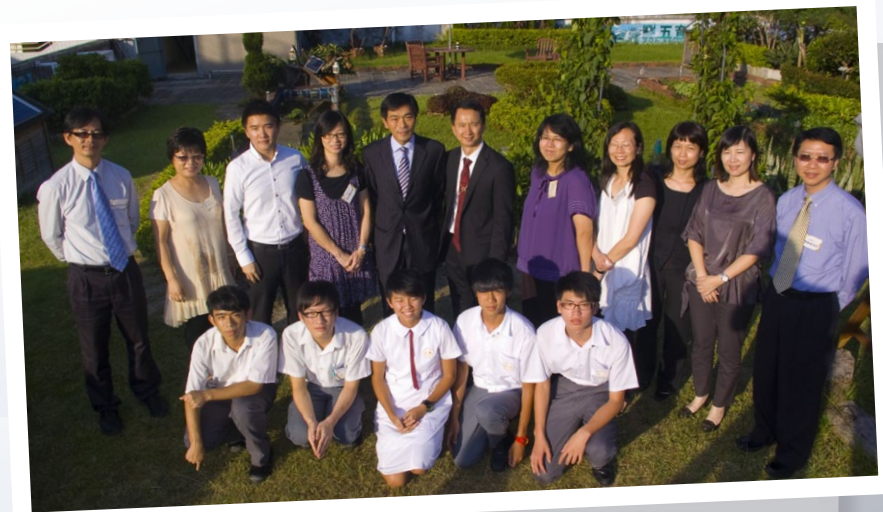
Visiting the green rooftop garden at Ng Yuk Secondary School 探訪五育中學，參觀綠化天台花園