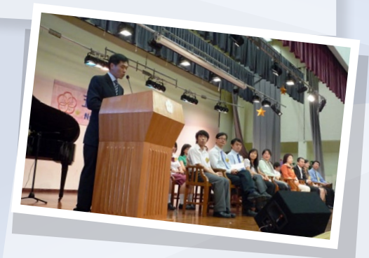
Our Managing Director speaking at Ng Yuk Secondary School's Opening Ceremony 會德豐地產常務董事於五育中學開幕禮致辭